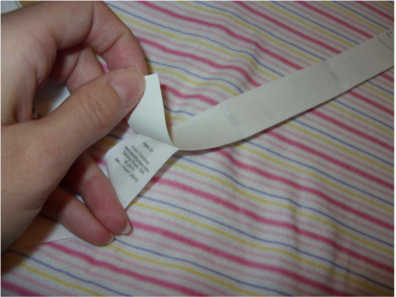
Carefully peel off the paper backing on the transfer.